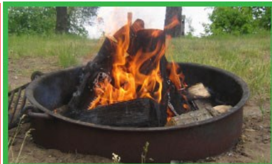
Burning Permit Not Required